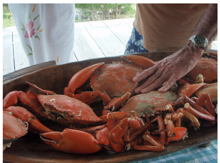
Point Noir Mud Crabs

QUOTE: "Diogenes struck the father when the son swore"